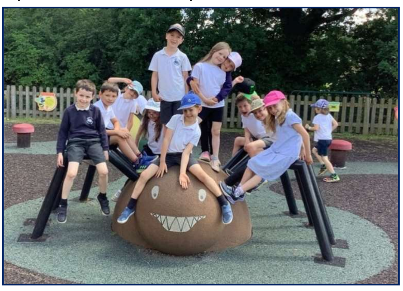
We hope you all have a good weekend!

12<sup>th</sup> July – School closes for the summer holiday